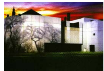
DuSable Museum, Chicago

Children's Plus and the CTLA are proud to present a discussion of black history through children's literature. Leading our discussion will be a special guest from the DuSable Museum, Chicago. Don't miss the opportunity to learn more about this special museum and what it has to offer you and your students.